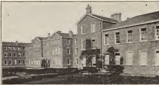
ONE OF THE FIVE ORPHANAGES AT BRISTOL.

I have been askt again and again lately, will the orphan work go on?